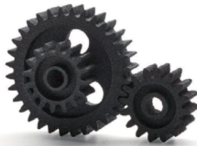
Picture taken after dye post-processing

Get precise small features and detail such as small fine holes, walls and shafts with dimensional accuracy thanks to HP's unique Multi-Agent printing process