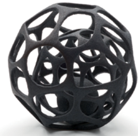
Picture taken after dye post-processing

Robust thermoplastic that optimizes part quality with cost, producing strong structures